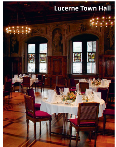
Lucerne Town Hall